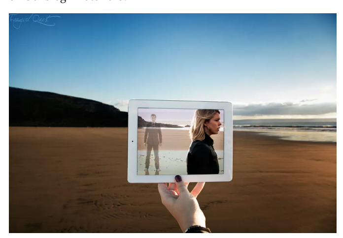
Doctor Who sceneframe at Dunraven Bay.

"Originally, those first sceneframing photos were supposed to be it, but once they got so much attention, we figured this is maybe something we should keep on doing." The attention they speak of are shares on social media like Twitter, Facebook and Pinterest. They launched their official blog in late 2013.