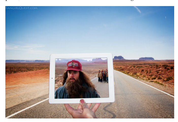
Forrest Gump sceneframe in Monument Valley.

For the future, they are planning to sceneframe Game of Thrones , so Northern Ireland, Croatia and Iceland are high up on their list. "At some point, we'd also love to visit New Zealand. Visiting locations from Lord of the Rings and The Hobbit would be an amazing dream come true!"