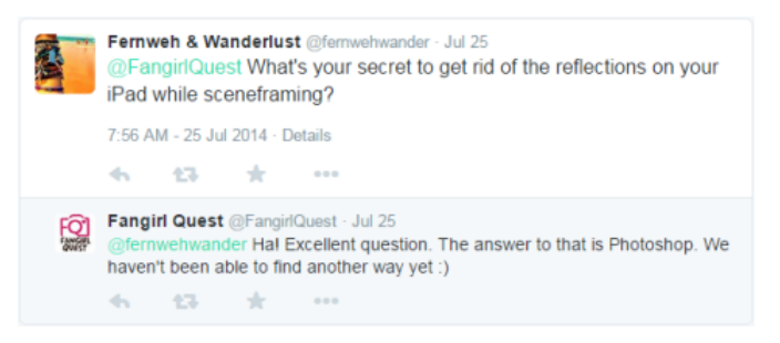
FangirlQuest answering a tweet and revealing the secret to their success.

Sceneframing may not be as easy as it looks, however. You need to get the angle just right, and there is a pesky little problem fans encounter: the sun reflects so much off the iPad (or other tablet PC, or even printed out pictures), that the glare makes the screencapture almost unrecognisable, even if you use a glare protector. Which is hard if you try to line up a shot and can't see what you're trying to recreate. However, the girls mentioned a work-around on Twitter: